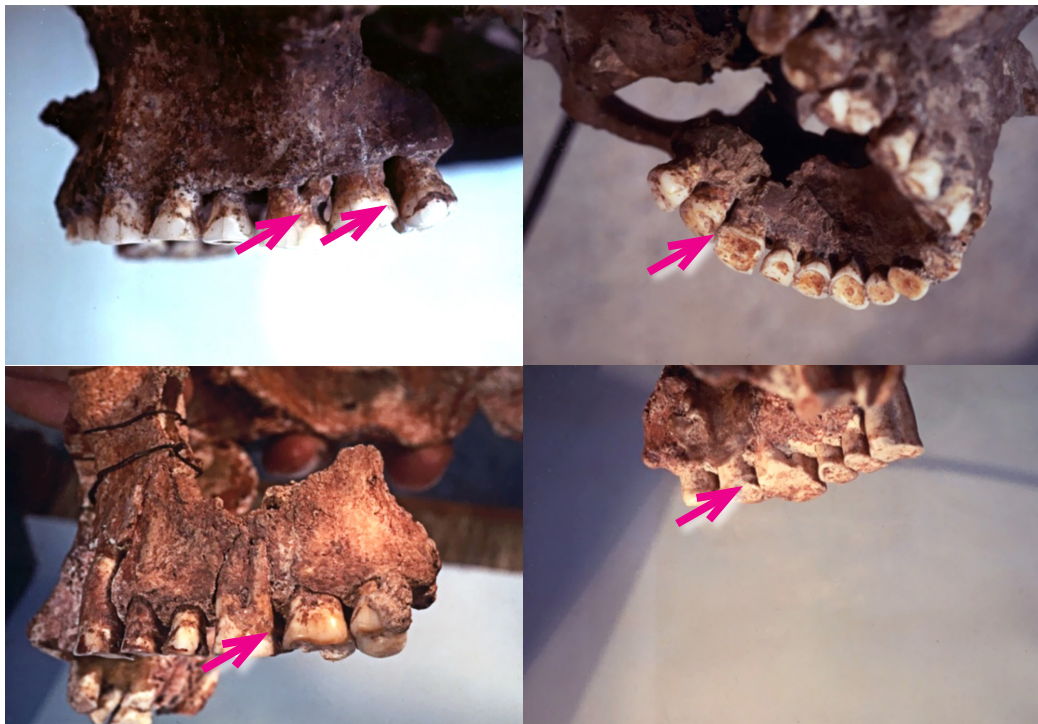
Fig. 9 - Interproximal grooves between M1 and M2 shown by Barma Grande 5 (top) and Barma Grande 2 (below). The colour version of this figure is available at the JASs website.

the flint originates from the mountain of Lure (Haute Provence) in Southern France (Onorardini et al. , 2011), it is well known that ivory is a very rare material both in Italy and Southern France because of the near absence of mammoth during this time period in these regions. In addition, as pointed out by Mussi and co-workers (2000a), ivory carving requires experience and skills that can only be acquired in Central or Northern Europe where the material is abundant. Thus, lithic material and ivory items found far away from where their origin support the idea that both logistical and residential mobility were important components of the lifestyle of Gravettian populations (Gamble, 1986; Flébot-Augustin, 1997).