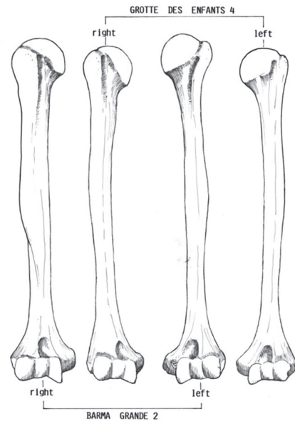
Fig. 8 - Humeral bilateral asymmetry exhibited by Barma Grande 2. Note the extraordinary right-left difference in comparison with Grotte des Enfants 4, another robust male from Grimaldi.

The adult male also shows an unusually high degree of upper limb bilateral asymmetry, with the right side well above the mean values of other Upper Paleolithic male specimens (Churchill & Formicola, 1997) (Fig. 8). Marked levels of upper limb lateralization are not uncommon in Upper Paleolithic samples, reflecting in most cases bone