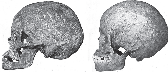
Fig. 10 –The alveolar prognatism emphasized by Verneau on the “Negroids” from Grimaldi: Grotte des Enfants 5 (on the left) and 6 (on the right). The colour version of this figure is available at the JASS website.

Meanwhile, back at the cave. Two years after the discovery of the triple burial, Abbo ran into two additional skeletons at Barma Grande. The first skeleton (Barma Grande 5), labeled as “a Cro-Magnon” by Verneau, belongs to an additional robust and tall adult male. What makes this individual remarkable, however, are the deep interproximal grooves affecting maxillary posterior teeth at the cemento enamel-junction. The grooves are well polished, show a tubular appearance or, more precisely, a conical outline with the buccal diameter much larger than the lingual one. Position, orientation, and shape of such grooves, also exhibited by other specimens from Grimaldi (Barma Grande 2 and Grotte des Enfants 4) (Fig. 9), are quite similar to those observed, among others, in North American Indians, Krapina Neandertals, and Atapuerca hominids (see Bermudez de Castro et al. , 1997 for references). This peculiar kind of wear most probably results from abrasion by thin and flexible material inserted repeatedly between adjacent teeth from the buccal side (Formicola, 1988c; 1991). Experimental evidence supports this interpretation (Hlusko, 2003). Repetitive probing, extending beyond the needs of oral hygiene and entering in the domain of stereotyped behavior, may have been the activity responsible for such changes.