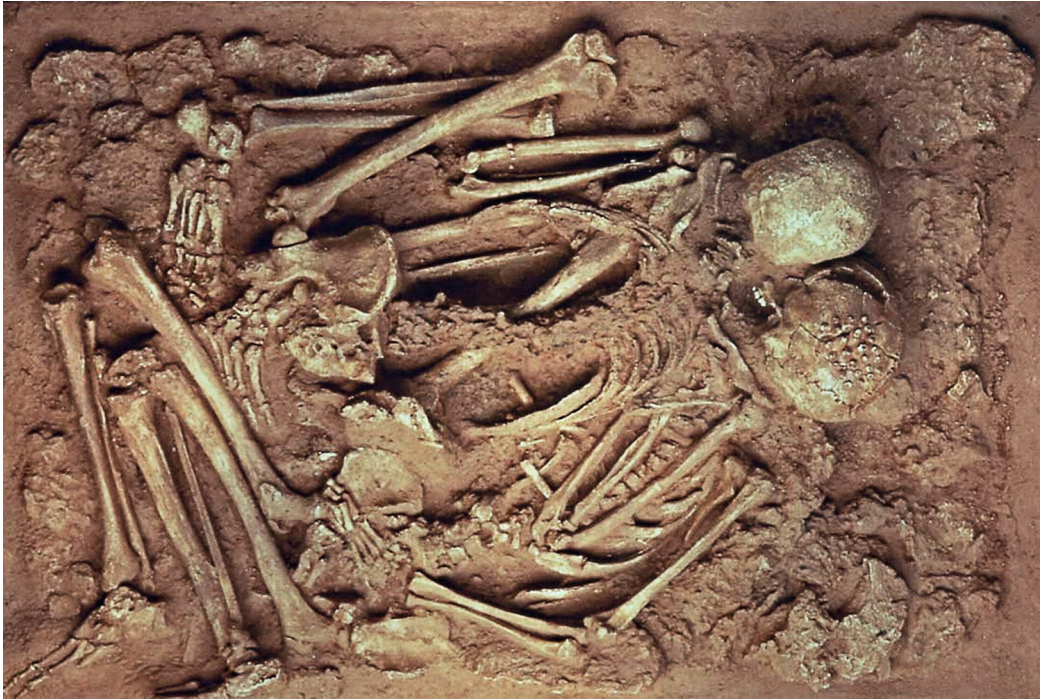
Fig. 11 – The original position of the skeletons from the double burial from Grotte des Enfants The old woman is buried face down in a highly contracted position, while the adolescent is lying on his right side with bent lower limbs. The colour version of this figure is available at the JASs website.