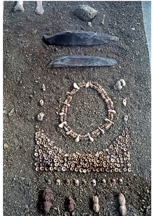
Fig. 6 – Long flint blades (top) and ivory ornaments (below) associated with the triple burial of Barma Grande. (Courtesy of Soprintendenza ai Beni Archeologici della Liguria). The colour version of this figure is available at the JASs website.

Verneau's observation about the presence a pit, partly preserved in spite of inaccurate excavations and trampling around the skeletons, provided the first evidence that the bodies were not left on the surface of the deposit, as suggested by Rivière. The digging of a pit and the presence of other funerary structures were confirmed by