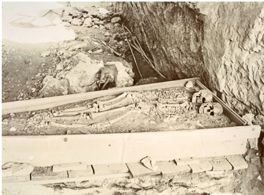
Fig. 7 - The adolescents of the triple burial from Barma Grande still located in the cave, i.e. before the losses suffered during world war II. The colour version of this figure is available at the JASs website.

The skeletons of the triple burial, based on Verneau's description and drawing, were lying side by side in an extended position. The apparent absence of perturbation of anatomical connections between skeletal elements and of the associated grave goods indicates that the burial was simultaneous. The skeletons were richly ornamented with abundant ocher, perforated marine shells, deer canines, pendants in carved ivory, and extraordinary long blades (Fig. 6). Grave goods and lithics strongly recall those associated with the skeleton of the Gravettian adolescent found in 1942 in the nearby Arene Candide cave (Finale Ligure) during stratigraphic excavations (Cardini, 1942). The skeleton of this beautifully ornamented youth ("Il Principe") is directly dated by AMS technique to 23,440 \pm 40 BP (Pettitt et al. , 2003).