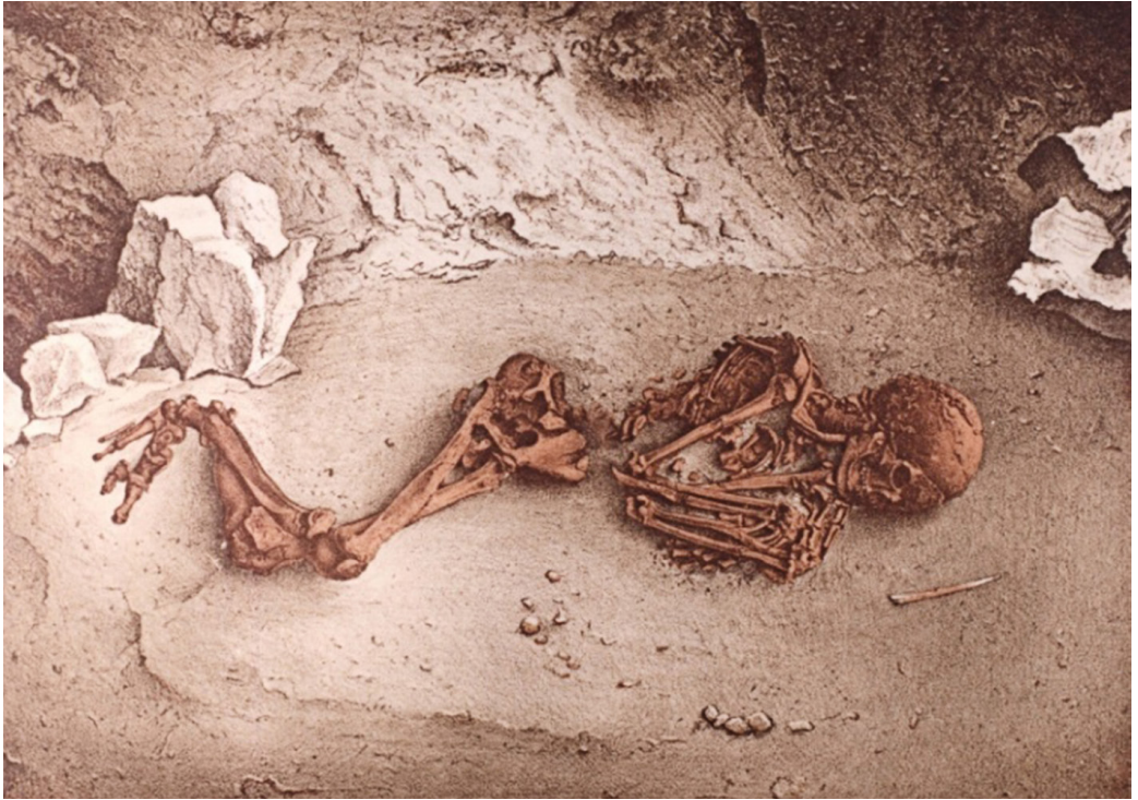
Fig. 2 - The Caviglione skeleton, as it appears in Rivière's book. The colour version of this figure is available at the JASS website.

supported by the age range provided by C^{14} dating of four shells from the headdress (Henry Gambier, 2001). Unfortunately, besides the description given by Rivière more than a century ago, no other published accounts are available.