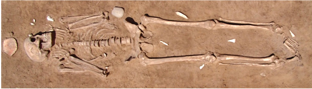
Fig. 3 – The specimen Grotte des Enfants 4 provides an example of the tall and linear body build characterizing Gravettian populations. The colour version of this figure is available at the JASs website.

Germain-en-Laye, and in part (BT 1 and BT 3) in the Musée Lorrain of Nancy. The events leading to the dispersal and re-discovery of these skeletons can be found in Legoux (1962, p. 114 and Fig. 2) and Villotte & Henry-Gambier (2010). Preliminary analyses confirm Rivière's sex attribution, provide details on the age of the specimens and identify foot and wrist developmental abnormalities, indicative of genetic relationship between the two adults (Villotte & Henry-Gambier, 2010; Villotte et al. , 2011).