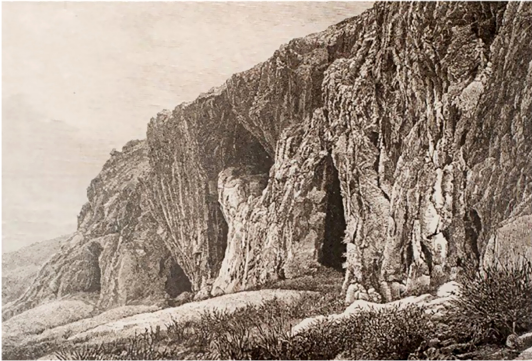
Fig. 1- View of the caves before the construction of the railway. The colour version of this figure is available at the JASS website.

promoted by two factors: accessibility of the caves, close to renown localities of the Riviera and the Cote d'Azur, and the echoes from the debate on the origin and evolution of man. After an initial exploration carried out in 1846 in the cave that takes its name from the Prince of Monaco, Florestan I, the first productive excavations were carried out by Emile Rivière, a French doctor who temporarily moved to Cannes because of health problems. His interest in the site was stimulated by the archeological material emerging from the talus of these cavities during the construction of the railway line connecting Genoa to Nice.