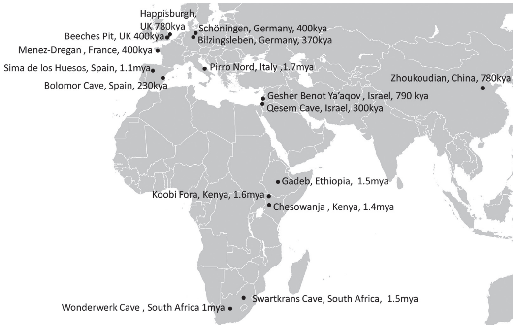
Fig. 2 - A map of Plio-Pleistocene sites in Africa, Asia and Europe where evidence for hominin use of fire is known in each region. Only sites mentioned in this review are shown. Dates are taken from the following sources: Gowlett et al. , 1981; Clark & Harris, 1985; Brain, 1993; Bellomo & Kean 1994; Mercier et al. , 2004; Rolland, 2004; Thieme, 2005; Mania & Mania, 2005; Preece et al. , 2006; Arzarello et al. , 2007; Karkanas et al. , 2007; Carbonell et al. , 2008; Richter et al. , 2008; Alperson-Afil & Goren-Inbar, 2010; Berna et al. , 2012; Peris et al. , 2012.

2006; Alperson-Afil et al. , 2007; Alperson-Afil & Goren-Inbar, 2010). Thermoluminescence analysis indicates that wood and flint artefacts were burnt continuously during the 100,000 year occupation, and the distribution of the lithics further suggests burning in specific areas, as would be the case in a hearth-like arrangement (Alperson-Afil & Goren-Inbar, 2010; Alperson-Afil et al. , 2007). It is unlikely that natural fires are responsible for the thermal damage or spatial patterns of artefacts found at the site; the frequency of burnt organic materials, including presumed food items, are not high enough to be attributed to natural wildfire and the repetitive nature of fire over such a long time period further infers that hominins were able to ignite and maintain it themselves without harvesting flames from natural sources (Goren-Inbar et al. , 2004; Alperson-Afil, 2008; Alperson-Afil &