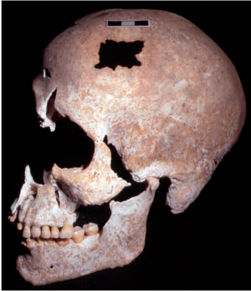
Fig. 1 - The skull of Individual 1 with the trepanation opening.