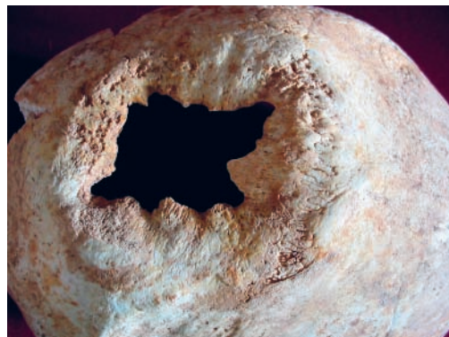
Fig. 3 - A close up of the opening which shows the complete healing of the edges with new depositions of bone with small osteitic pits.

For the Ebla subject the opening was performed by an incision. This technique was made using a very hard and sharp instrument. The holes, which are achieved through the progressive cutting of the surface of the skull, can be shaped in many ways: circular, fusiform and, like in this subject, quadrilateral. A metallic blade was probably